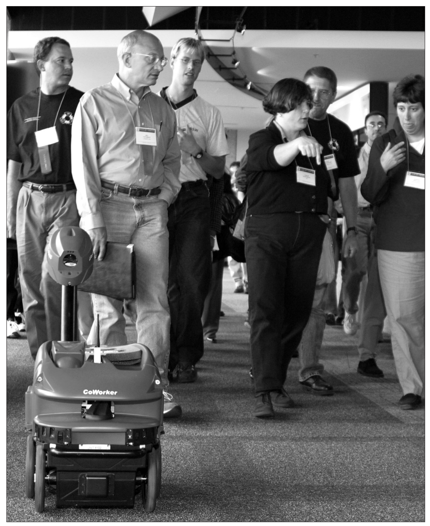
Figure 1. IRobot: CoWorker in Edmonton Alberta's Shaw Conference Centre, AAAI-02.