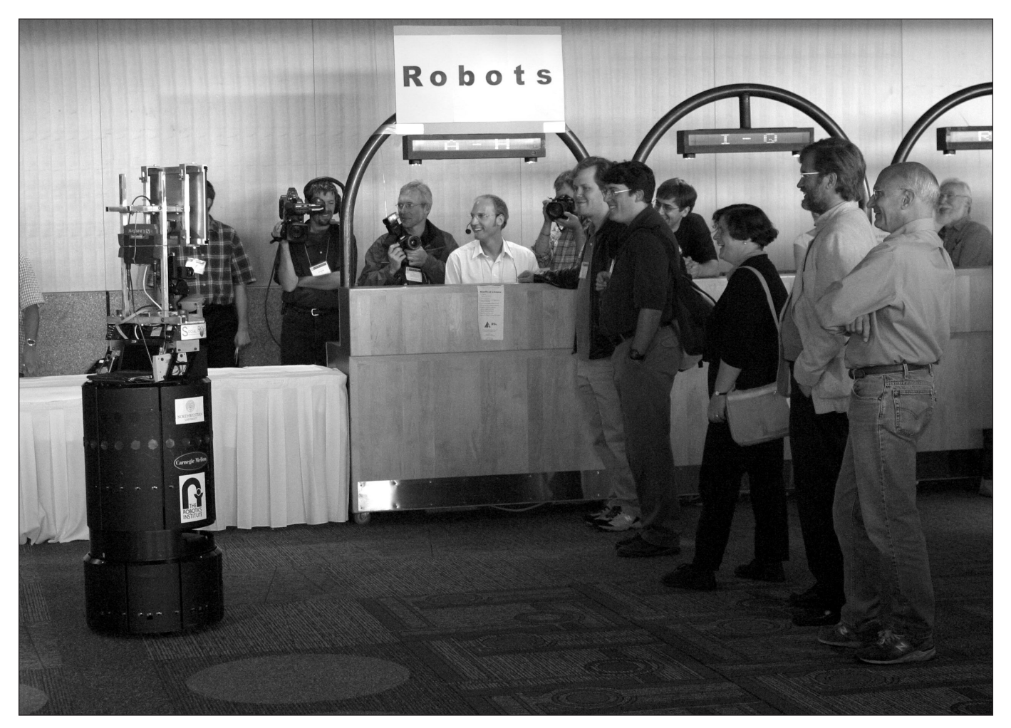
Figure 3. GRACE Approaching the AAAI–02 Registration Desk.

the judges were told that the language understanding component worked correctly, once the speech input had been captured. Unfortunately, the failure of the front end made the language understanding difficult to see. Two gesture-recognition methods were planned, one using vision and one using Palm Pilot input, but neither was in working order during the Challenge itself, so they were not successfully demonstrated.