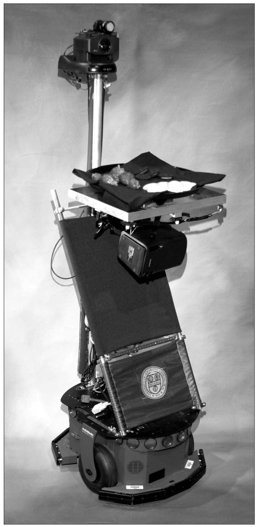
Figure 3. MABEL, the Mobile Table from the University of Rochester.

in unanticipated ways (such as clustering around, asking questions, or purposefully foiling the robot's attempts to move). This situation also makes navigation more difficult for the robots. Also, being in such noisy environmental conditions, it was hard for the teams to demonstrate vocal interactions with people. However, because the robots still have some limitations to overcome before becoming real servants, vocalization helps people focus on what the robots are trying to do as part of the interaction. Such problems have to be taken into consideration when we move robots out of the controlled conditions of research labs. The Robot Host event is a great opportunity to experiment in such a context. The event also serves as a common evaluation test bed for the different approaches used to implement the intelligent decision-making processes required by the autonomous robot servants.