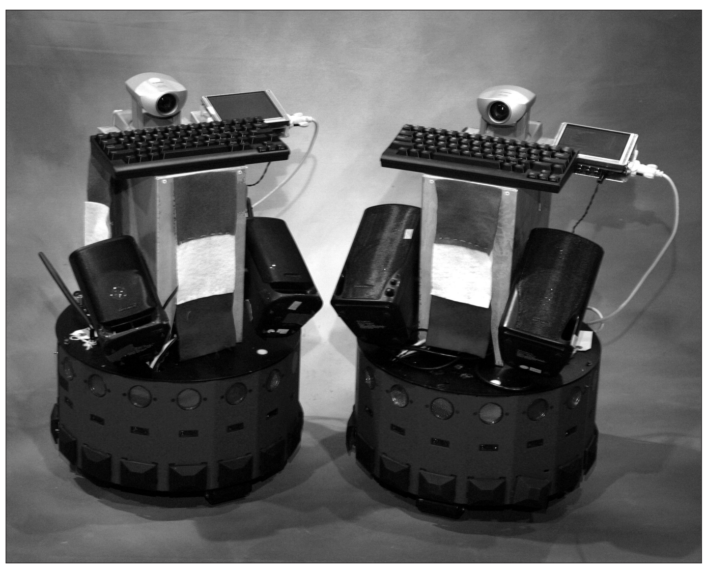
Figure 2. FRODO and ROSE.

face; the robots could use the shirt information in conversation with conference participants.