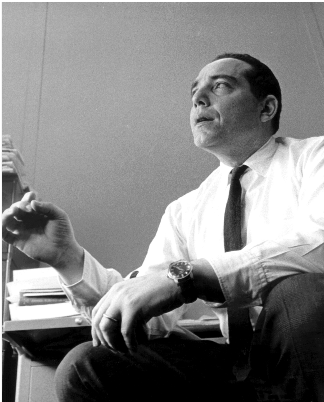
Saul Amarel, February 16, 1928 – December 18, 2002