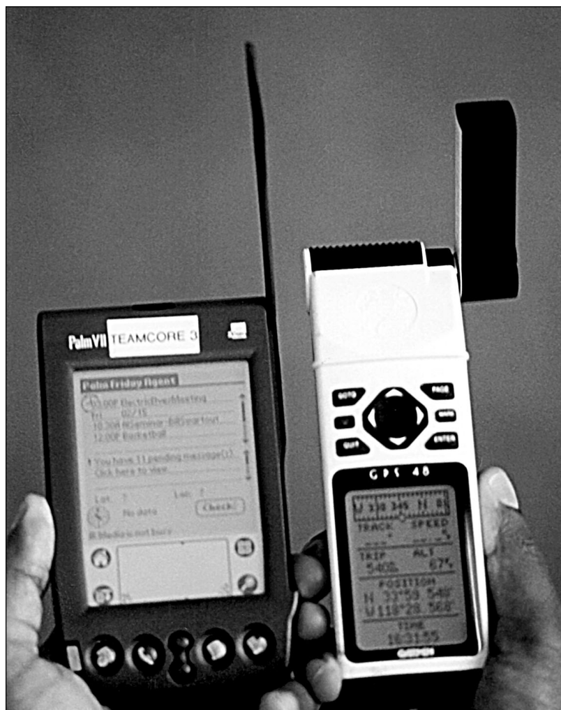
Figure 1. A Palm VII Personal Digital Assistant with Global Positioning System Receiver.

agents, including 9 proxies for 9 people plus 2 different matchmakers, 1 flight tracker, and 1 scheduler running continuously for the past several months. This article discusses the tasks performed by the system, the research challenges it faced, and its use of AI technology in overcoming these challenges.